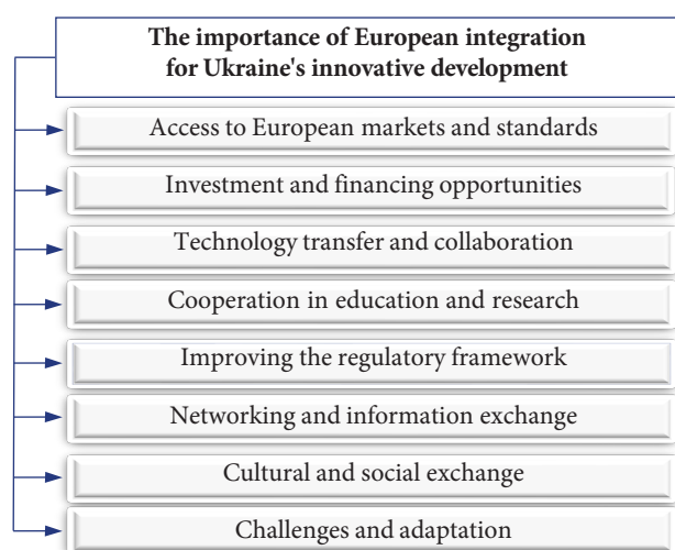
Figure 1. The importance of European integration for Ukraine's innovative development

The importance of European integration for Ukraine's innovation development is significant, as this process can significantly enhance Ukraine's innovation capacity in various sectors. Figure 1 shows several key aspects of how European integration can contribute to Ukraine's innovation development.